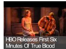
HBO Releases First Six Minutes Of True Blood