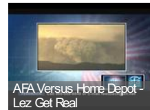
AFA Versus Home Depot - Lez Get Real