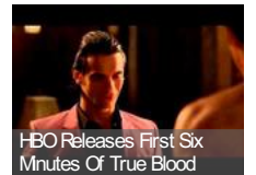
HBO Releases First Six Minutes Of True Blood