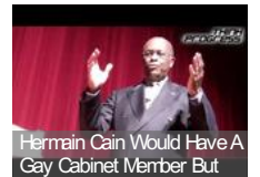
Hermain Cain Would Have A Gay Cabinet Member But