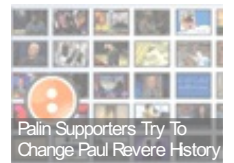
Palin Supporters Try To Change Paul Revere History